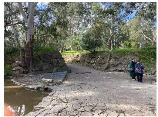
9. Cross this nice cobble stone bridge over the Maribyrnong River.