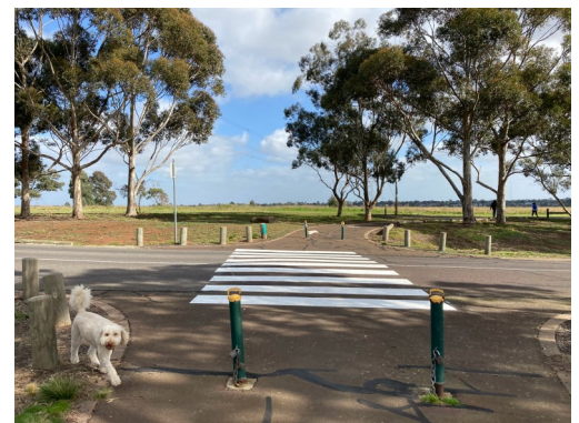
18. Cross the road and follow the main trail to the right.