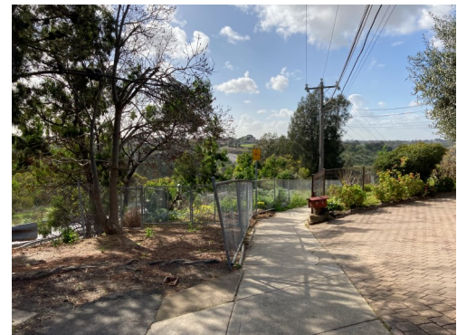
3. At the end of the quiet side street, keep walking East and follow the pathway down towards the park.