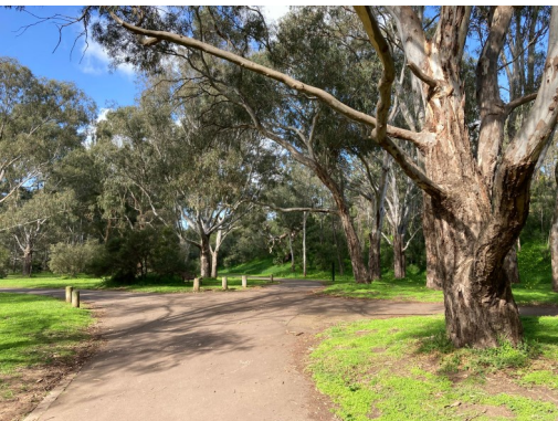
13. At this track junction, go straight ahead to follow the main trail.