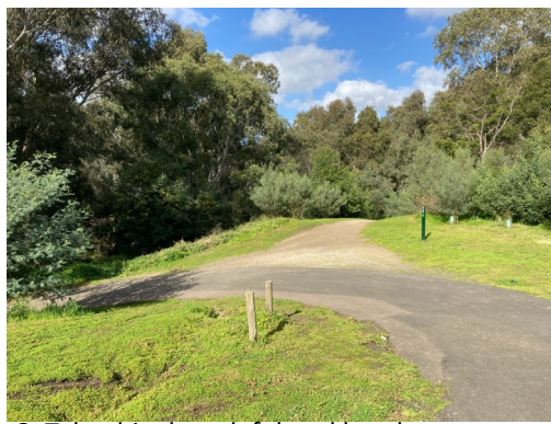
8. Take this sharp left hand bend as you approach the river.