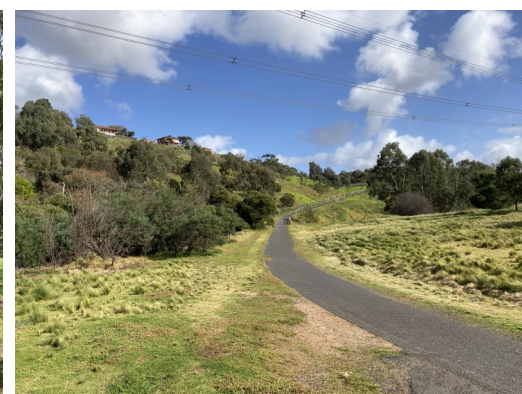
30. Looking back towards the start and where Green Gully Road leads back to the bus stop.