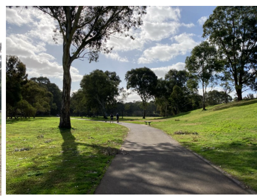
24. Keep following this trail and keep left till you come to the large oval on right.