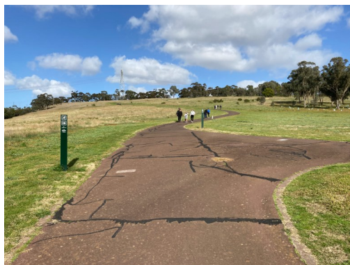
17. Keep on heading straight up the hill towards the road.