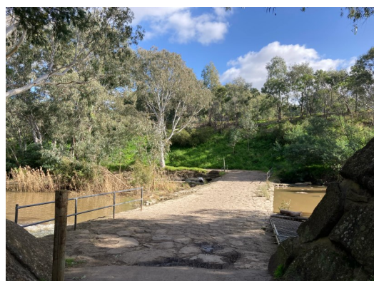
28. Walk your way back to where you started. Enjoy the river views!