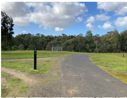
7. After about 100m in the trees, follow this trail to the right as it heads to the river.