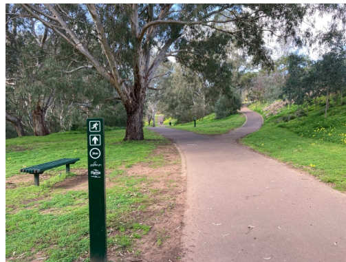
14. About 150m from the last junction, keep left and continue to follow the river.