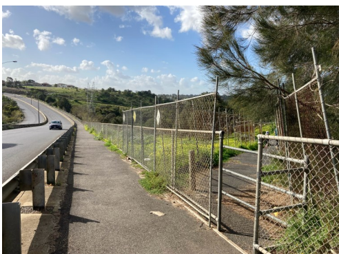
4. After the switch backs, take a right here onto the trail into the park.