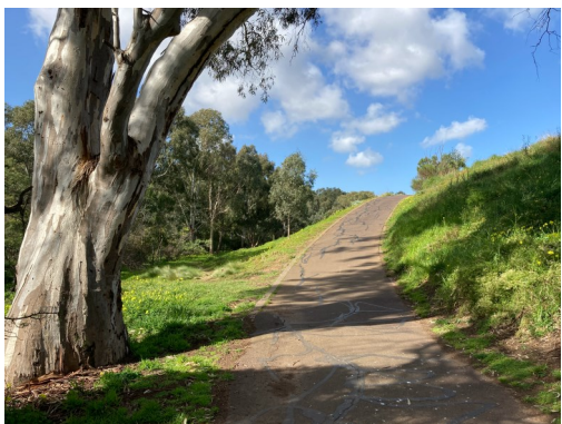
16. Here you will begin to walk uphill and leading away from the river.