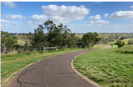
20. After 500m walking high on the hill, you will reach this bend that leads downhill.