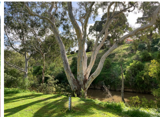
15. Remember to stop and enjoy the beauty of the place!