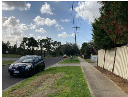
2. After walking 20m North towards the main road, turn right and follow the quiet side road.