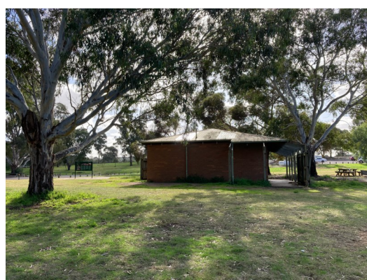
22. After walking by the picnic area and car-park, you will see this toilet block.