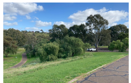
21. After 400m of walking downhill, you will come to this carpark and picnic area.