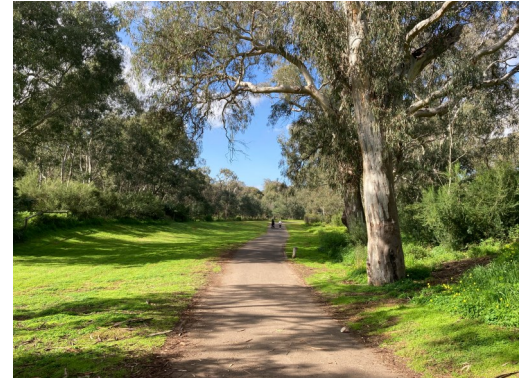
12. Keep on this nice track that follows the river.