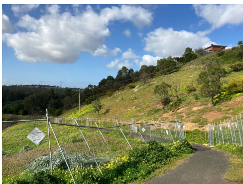
5. Follow the track downhill for 200m until the next track junction.