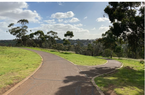
19. 150m from the crossing, keep left and enjoy the views.