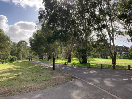
10. 20m after walking away from the River, turn left and follow the river.