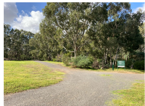
6. At the bottom of the hill, turn left towards Brimbank Park