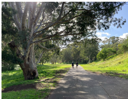
26. Follow this lovely trail for another 200m until you back near the bridge.