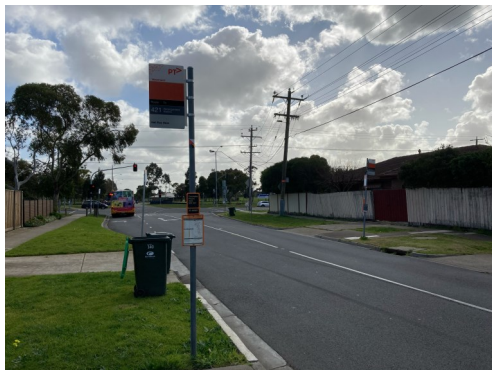
1. The Bus Stop that gets you close to the park. Driscolls Road, Kelba, 3021.

Walk description: Brimbank park is great for its ample open space, wide paths, placid waterways and gentle terrain. This walk starts up on the hill in Kealba and drops down to Maribyrnong River where there are a network of trails and tracks to follow. The track marked out on this map is the standard, wide track that loops around the park mostly along side the river. There are numerous toilets, water fountains, BBQs, shelters and even a café should you wish to grab a bite or beverage. This walk is mostly flat but does have some gentle inclines and a fair amount of distance, hence why its labelled as 2 foot (Moderate).