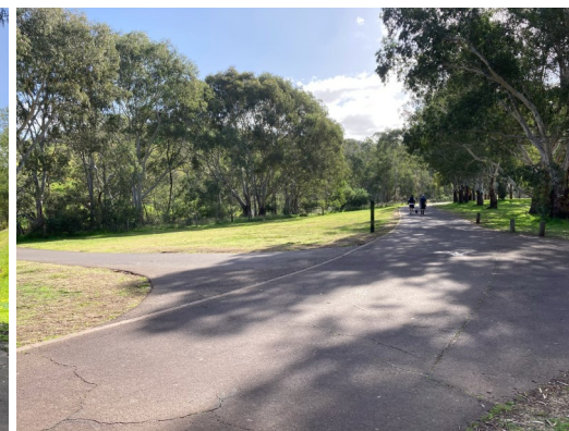
27. Here you take the left turn, back down to the river.