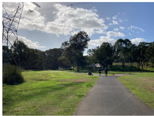
25. With the oval on your right, turn left towards the large powerlines.