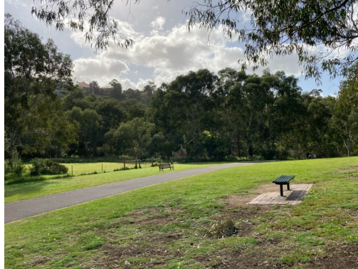
11. Sweet place to take a seat and enjoy the scenery.