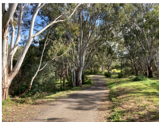
29. Enjoy the last leg of forest before heading out of the park.